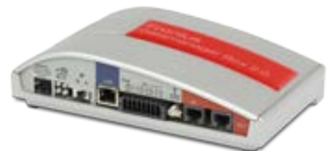
/ Fronius Datamanager Box 2.0